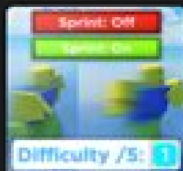
Sprint/Run Button System