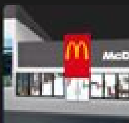
mcdonalds with parking lot