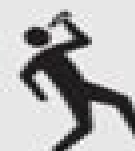
Trend of current alcohol drinkers