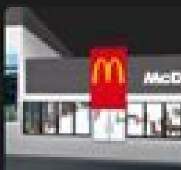
mcdonalds with parking lot