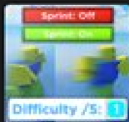
Sprint/Run Button System