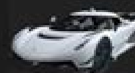
2018 Sports Car // Rosh