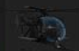
MD Helicopters MH-6 Little Bird