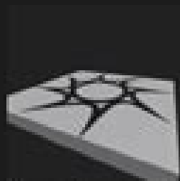
Neutral Spawn Location