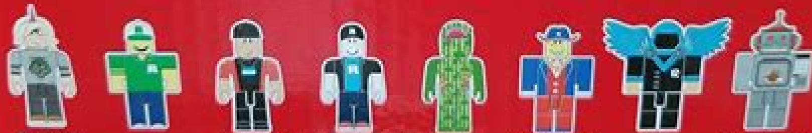
FreezeFishes Hypnot Roblox Staff Roblox Super Fan Sharkie Uncle Ben's Uncle Vasa Microverse Robot